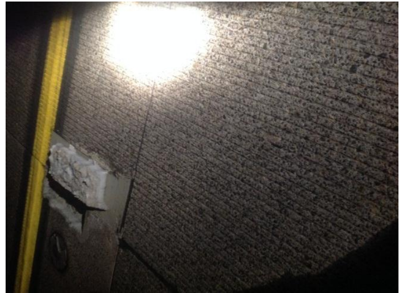
December 30, 2013 Patch Failure