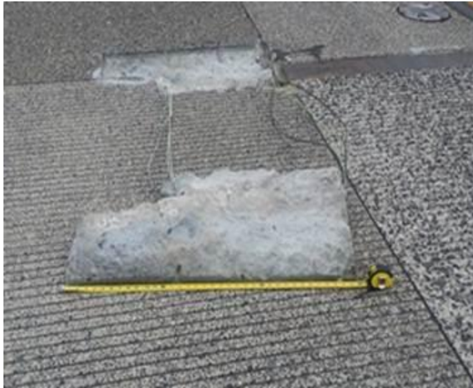
August 23, 2013 Patch Failure